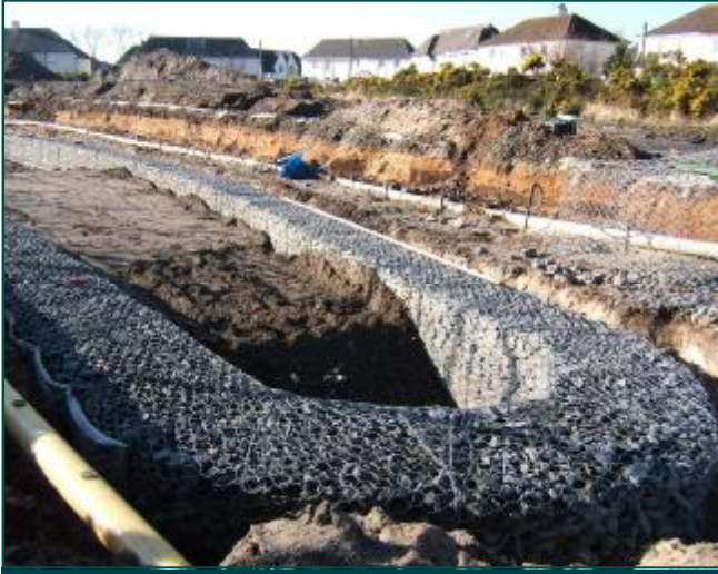
Suds Pond Gabion Walls Under Construction