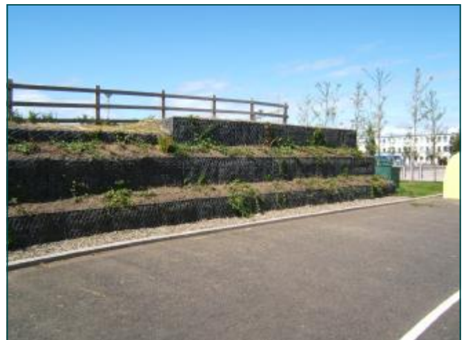
Completed Entrance Wall