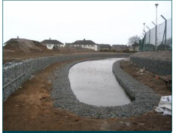
Suds Pond Gabion Walls Completed