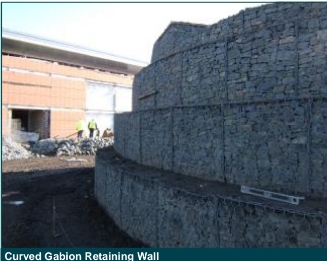
Curved Gabion Retaining Wall