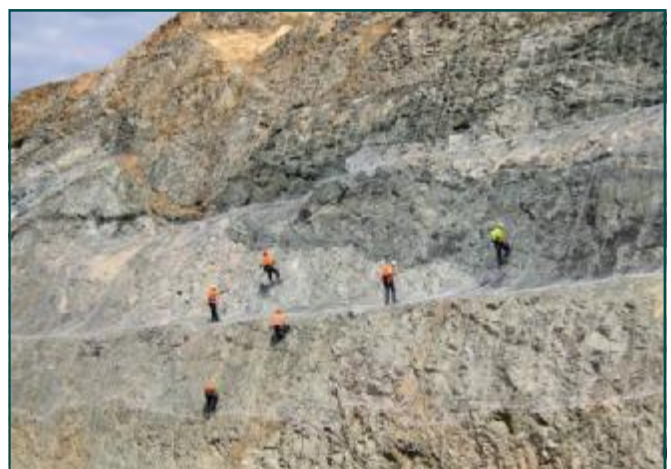
High strength Steelgrid being installed on rockface

Maccaferri Ltd - Head Office 7600 The Quorum, Oxford Business Park, North, Garsington Road, Oxford, OX4 2JZ T: 01865 770555 F: 01865 774550 E: oxford@maccaferri.co.uk Web: www.maccaferri.co.uk