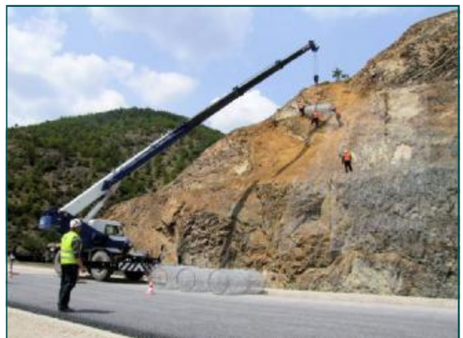
Steelgrid being lifted into position ready for fixing

The successful Bechtel-Enka/Maccaferri partnership arrangement is typical of the projects Maccaferri is increasingly undertaking with complex international projects, reinforcing their global presence, capabilities and experience.