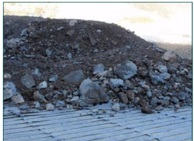
BBA Certified Paralink can accommodate many fill types