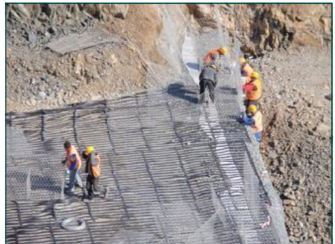
Laying Paralink primary reinforcement