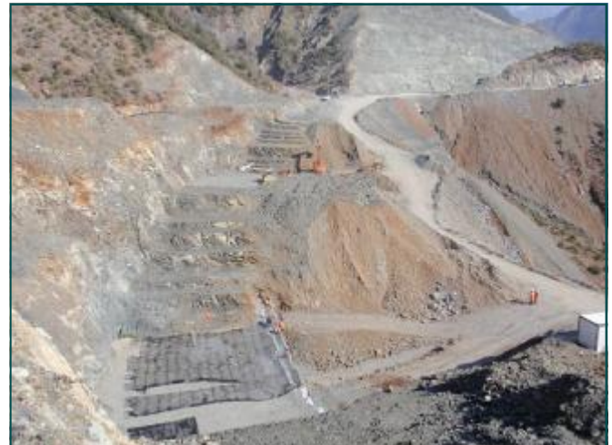
The first courses of the tallest wall being constructed