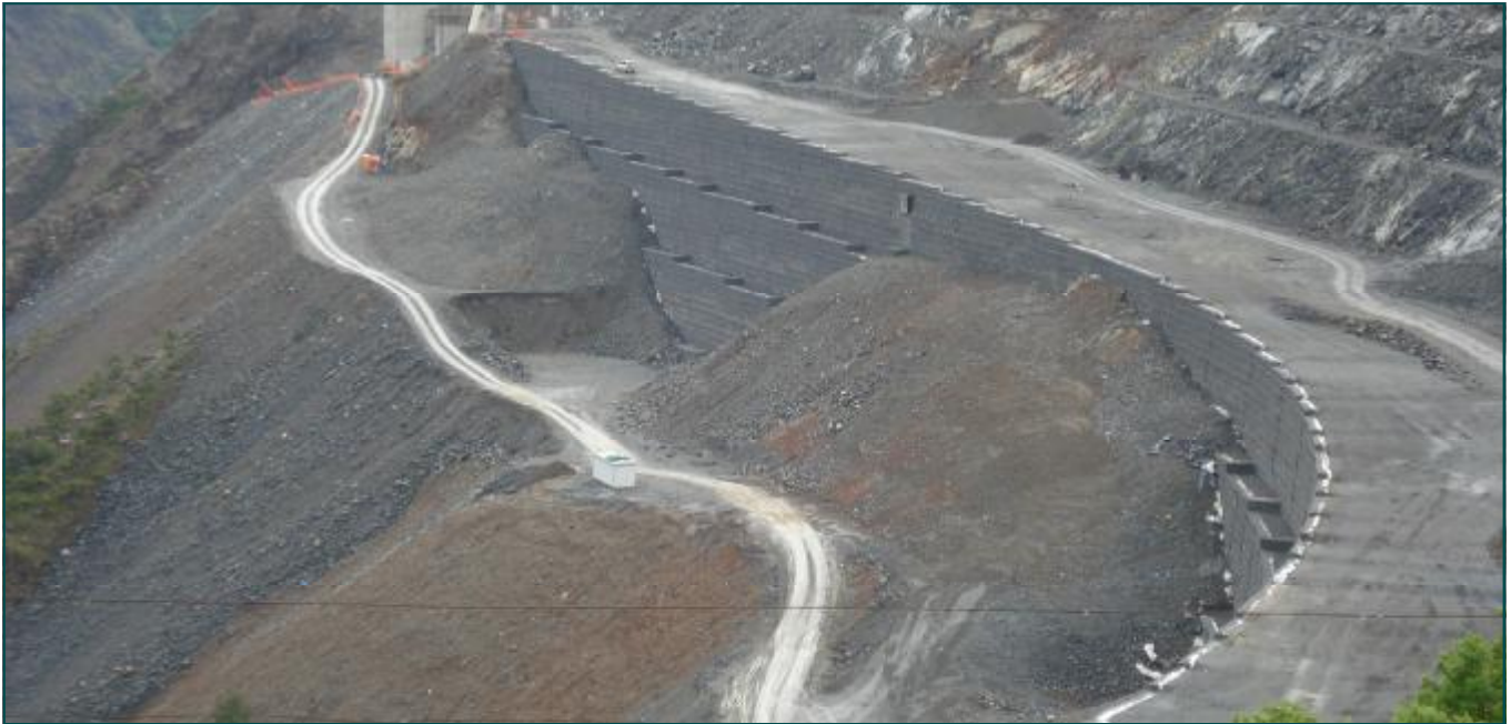
Overview of the highest wall nearing completion

identical to a gabion, and the geogrid tail is then sandwiched between layers of compacted backfill material, thereby reinforcing it. Having the geogrid tail integral with the fascia element removes the need for any on-site connection or pinning where errors during installation could occur due to incomplete connection, or reduced pinning frequency. Terramesh is rapid to construct, and can even reuse site won materials when suitable.