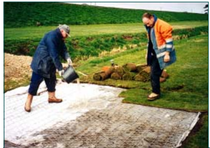
During installation Date: March 2000