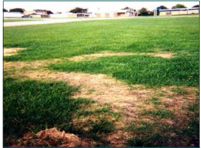
Before installation showing damaged ground January 2000

Big cost savings are made over other green paving systems because of the simpler preparation required.