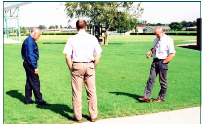
One year post construction

The showground site had a double decker bus parked on the site with no rutting to the grass surface.